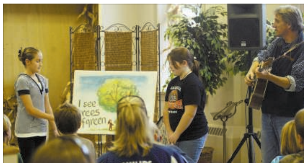
Children and parents enjoy Saturday's show at the Ludington Area Center for the Arts